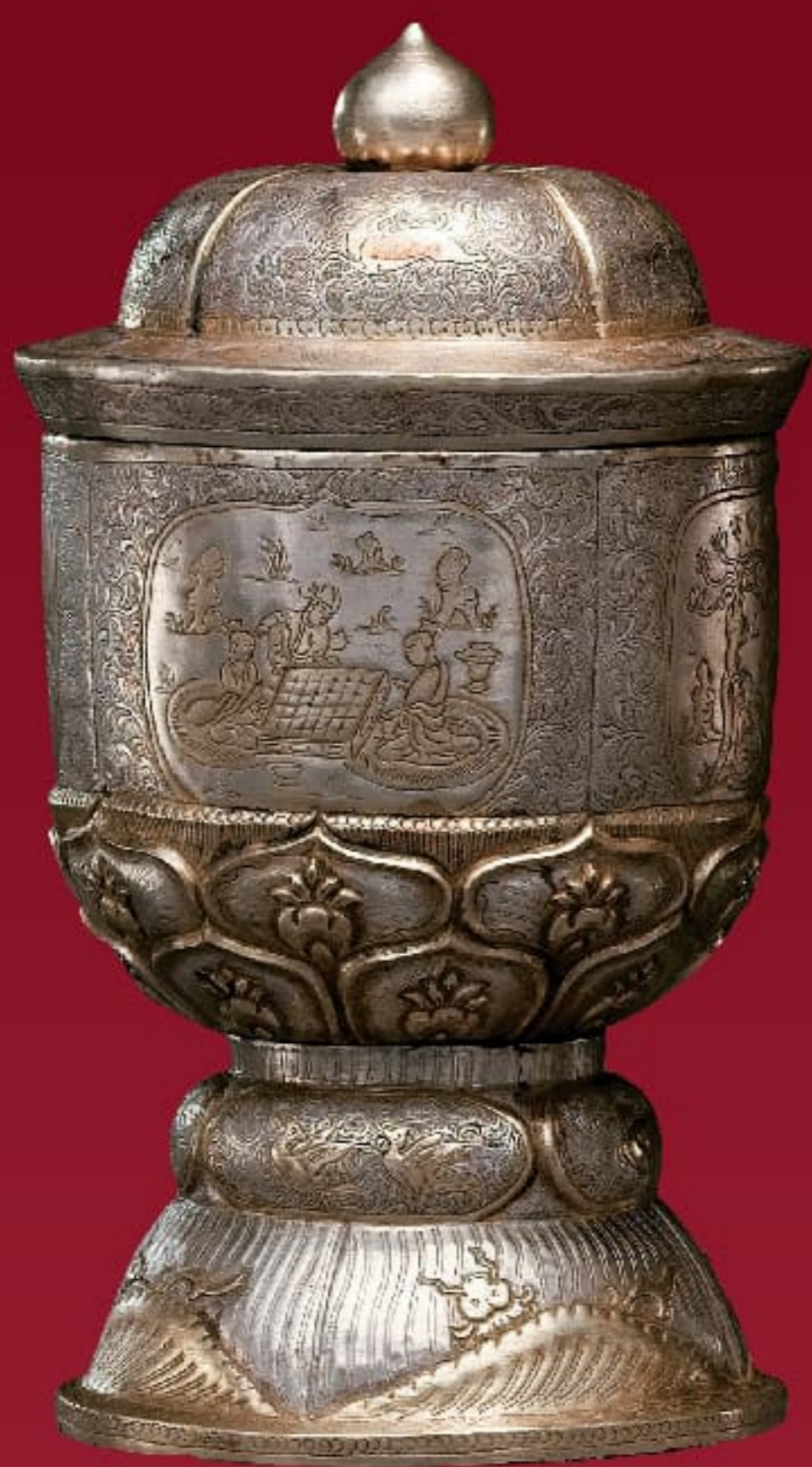
鍍金人物畫銀香寶子 Silver-gilt incense caddy with scenes showing human figures