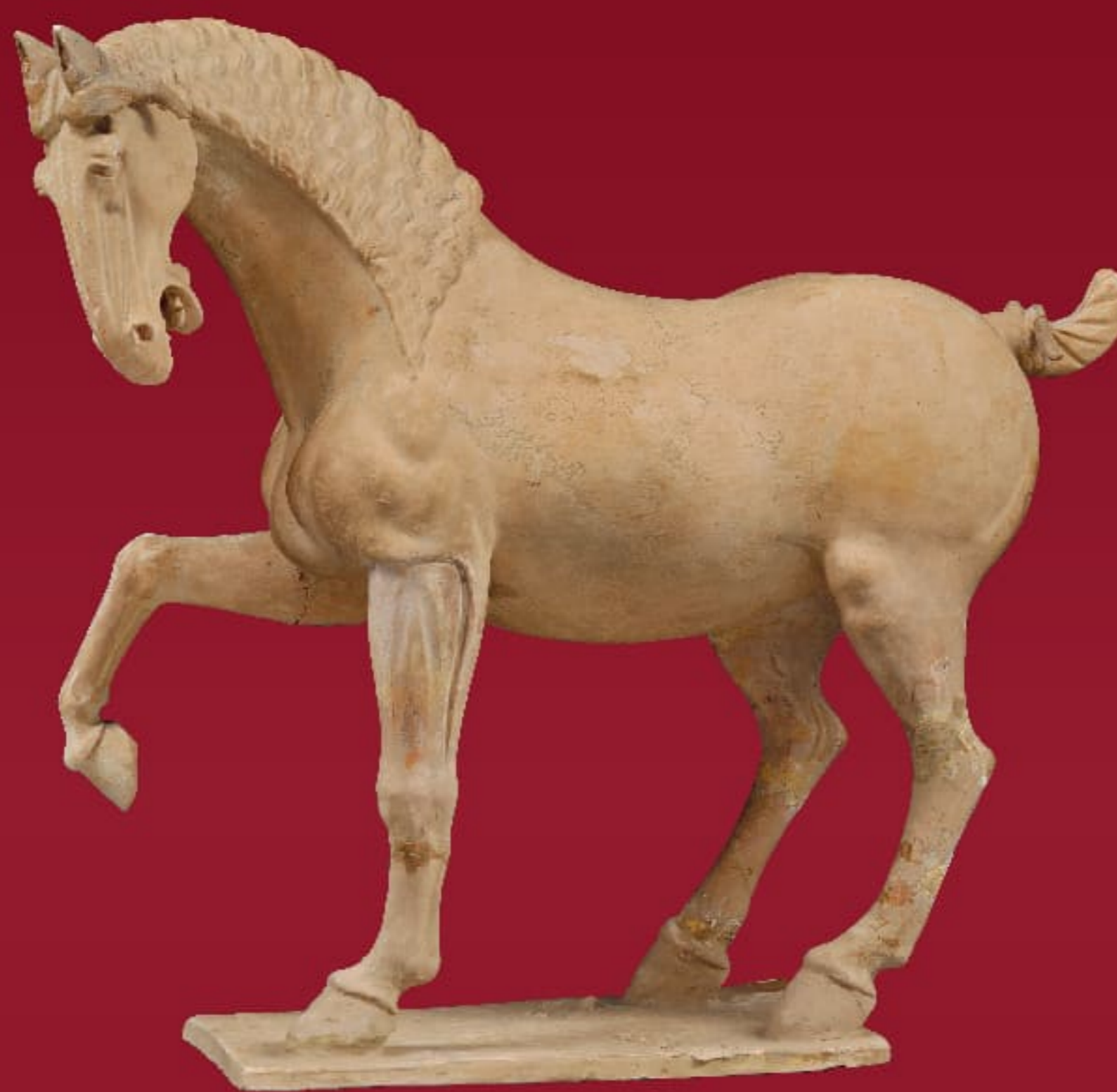
白陶舞馬 White pottery dancing horse

Tang dynasty Unearthed from the Underground Palace of Famen Temple Collection of Famen Temple Museum