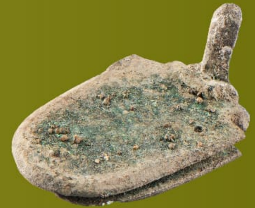
青銅腰帶扣 Bronze belt buckle

Tang dynasty Unearthed from Shek Kong, Yuen Long, Hong Kong Collection of Antiquities and Monuments Office, Development Bureau