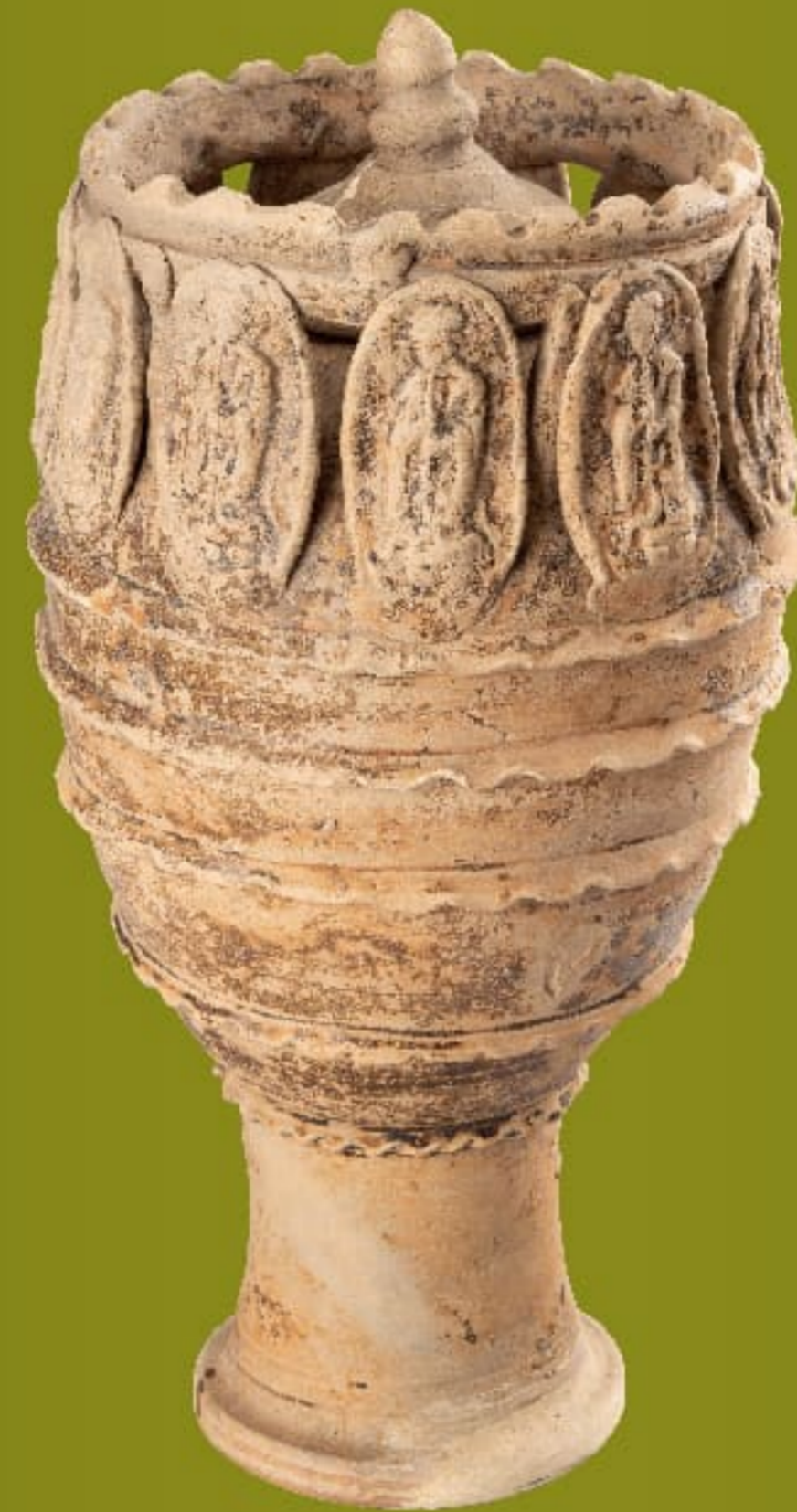
魂瓶連蓋 Spirit jar with lid

Tang dynasty Unearthed from Sham Wan Tsuen, Chek Lap Kok, Hong Kong Collection of Antiquities and Monuments Office, Development Bureau