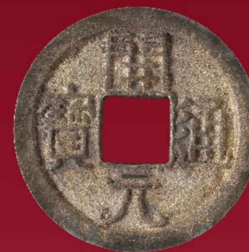
「開元通寶」銀錢 'Kaiyuan Tongbao' silver coin

Tang dynasty Unearthed from the tomb of Zhang Shigui, Liquan County, Xianyang City Collection of Zhaoling Museum