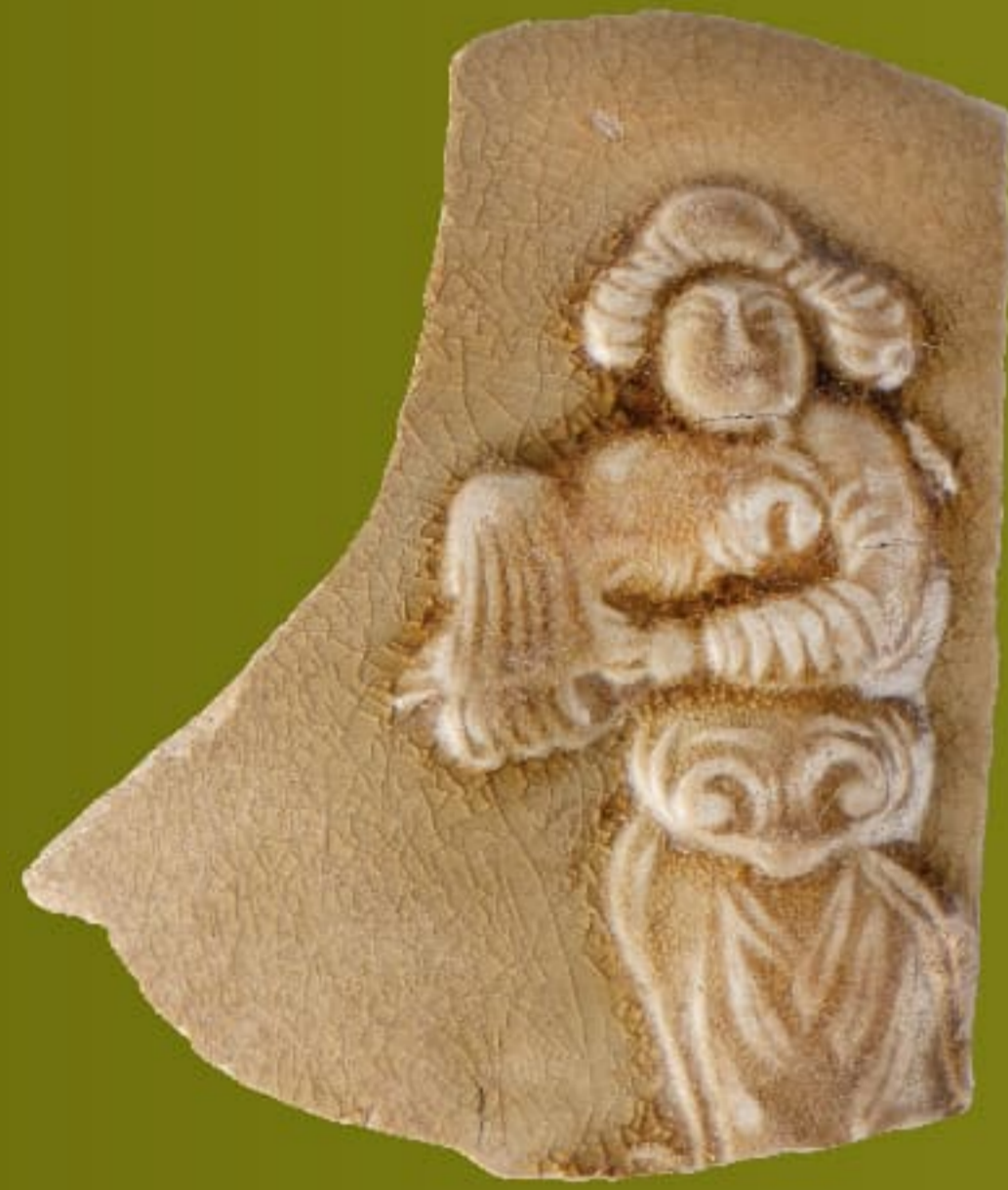
長沙窯釉瓷片 Glazed Changsha ware shard